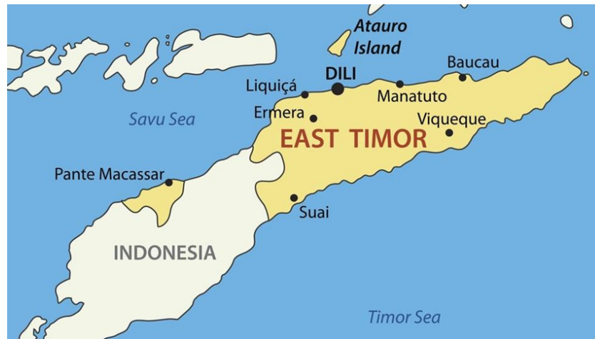
Figure 1 Map of Timor-Leste.

gas-rich Timor Gap. This was because Australia's intervention indirectly involved it in the conflict, and it 'facilitated' Timor-Leste's quest for independence by providing political support at the UN (Rumbia et al., 2022).